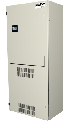
Centralized Lighting Inverter