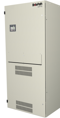
Centralized Lighting Inverter