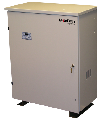
Centralized Lighting Inverter